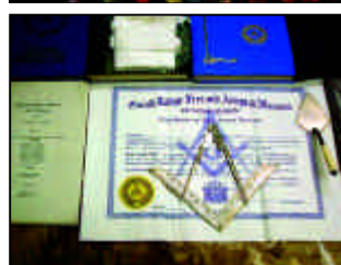
A Wisconsin treasure came to light October 7 as the cornerstone of the former Grand Lodge building on Milwaukee's East Side was removed during a renovation project. Hidden behind was a sealed container. It was opened with permission of the building's owner. A few of the 40 items it contained are shown at left. See story at right.